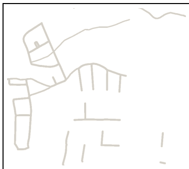
Figure 3: A generated tile of a map

In our special case, using an R-Tree means using the advantages of rectangular grid sections while eliminating the need for separate indexing or cumbersome preprocessing of data. The grid is comprised of the minimum bounding rectangles (which can be overlapping), whereas each element belongs to only one section and all sections contain a similar number of elements. Each node contains information about its children and the sizes of their respective rectangles. This allows for recursive search from the root along the different nodes, while for each node it can be quickly decided, whether it touches the area to be displayed (and therefore, whether data from its children has to be loaded). Elements can easily be distributed equally between grid sections and there is no need for a separate index file. Fig. 3 shows a tile of a map of Munich which has been generated using an R-Tree. This tile contains only data for a particular road type. We use the OTN ontology to separate the items in the tiles into instances of the same classes.